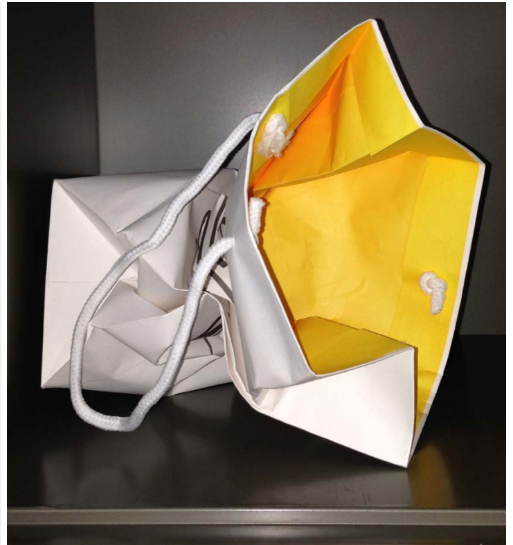
Untitled (Crushed) White with Yellow, 2010, paper, ink, string, 9" x 9" x 9"

One of Beaumont's most notable works is the environmental installation Ocean Landmark (1978-1980), a